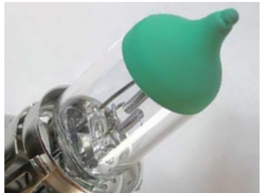
Ceramacoat™ 845-GLT applied to auto headlamp.