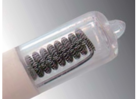
Lamp-Coat™ LC4040-SG applied to IR heater.