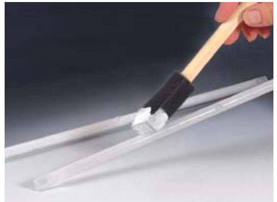
Quartz-Coat™ 850 applied to quartz IR heater tube.